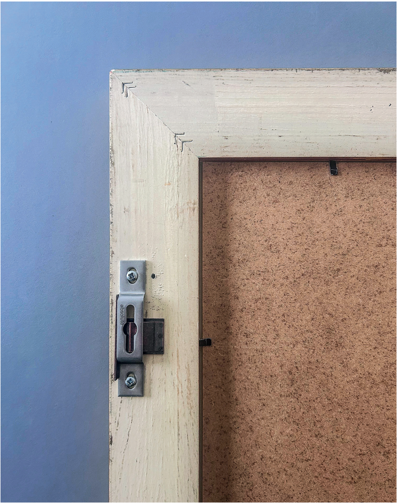
Pictured above: Large Ryman Hanger with Ryman Secure Spring Keeper (mid-level security option) on the back of a frame.

The hole in the centre of the Ryman Hanger fits over a screw in the wall, the Ryman Barrel (if using our Track System), or our Storage Hooks (if using on a storage rack). You then gently lower the artwork and it is fixed in place in the upper narrow channel. You can then insert your Spring Keepers for added security.