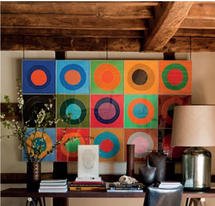
C Track in situ installed into a wooden ceiling.