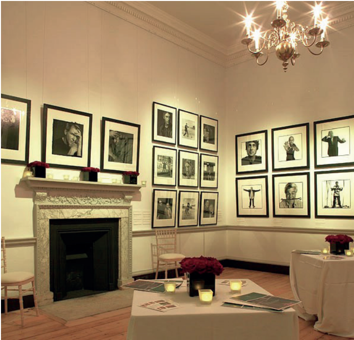
Fulham Palace, London, UK.