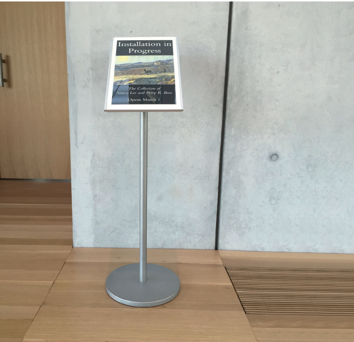
Kimbell Art Museum, Fort Worth, USA.