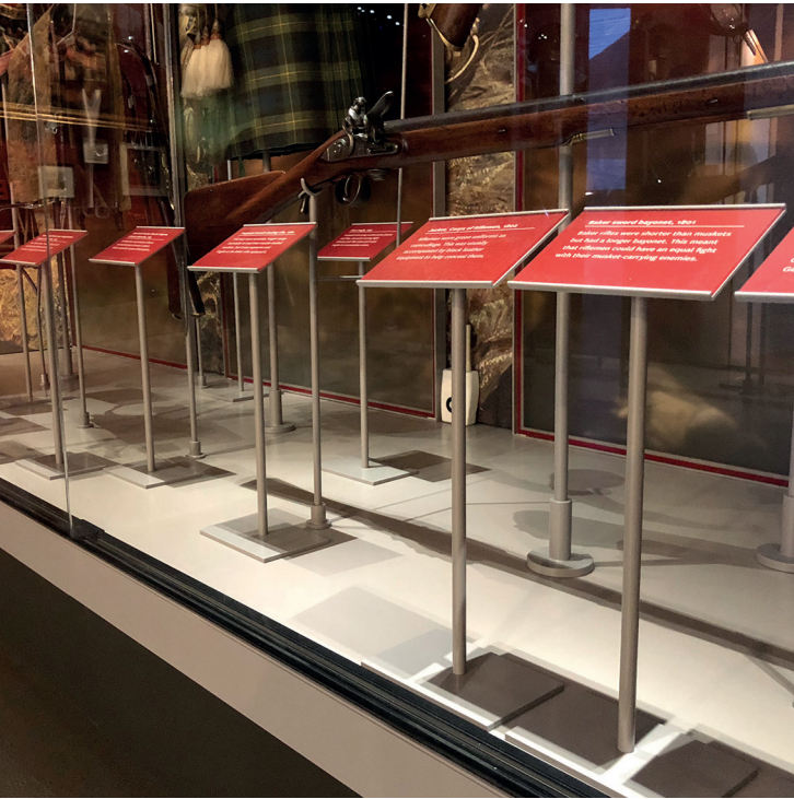
National Army Museum, London, UK.