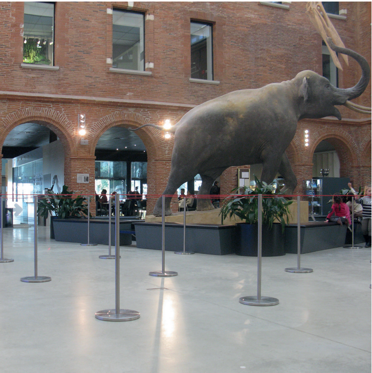
Museum de Toulouse, France.