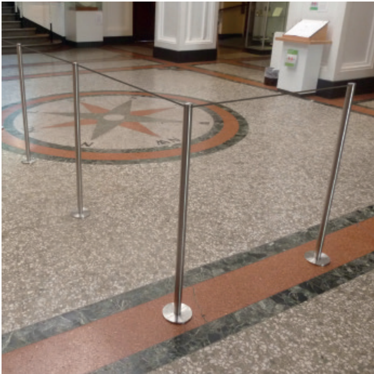
Plymouth Museum, Devon, UK.