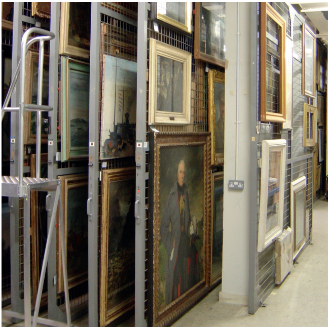
Artwork Storage, Imperial War Museum, London, UK.