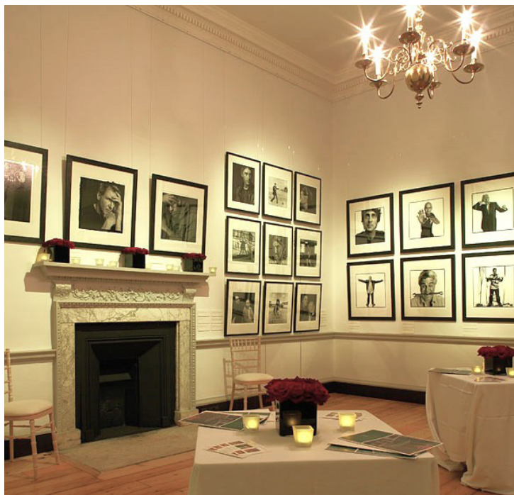
Fulham Palace, London, UK.